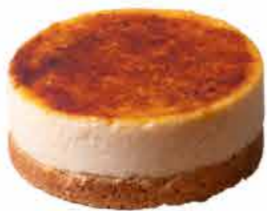
焦糖起司蛋糕 Caramel Cheese Cake NT$ 120