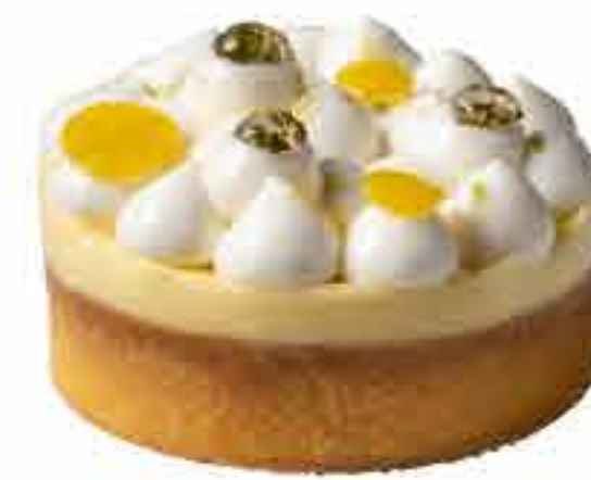
羅勒檸檬小塔 Sweet Basil Lemon Tart NT$ 120