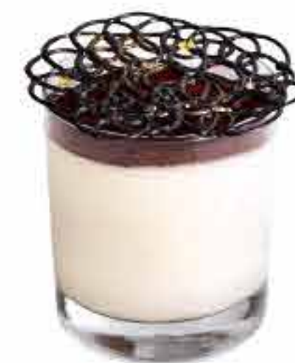
提拉米蘇(含酒) Tiramisu (Alcoholic) NT$ 220