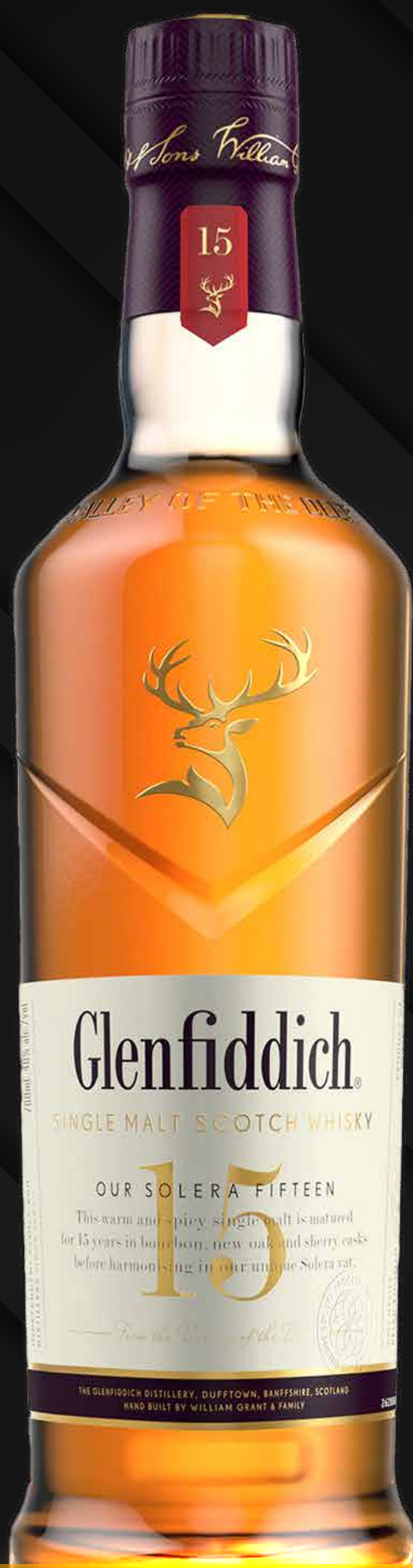
格蘭菲迪15年 Glenfiddich 15Y