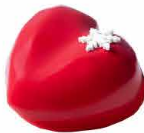
抹茶百香果提拉米蘇 Matcha Passion Fruit Tiramisu NT$ 120