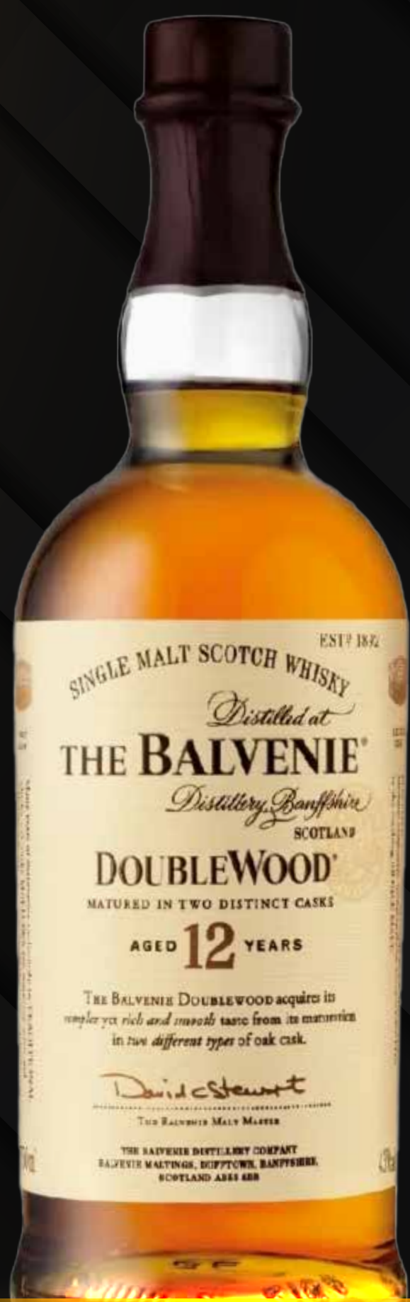
百富 12 年雙桶 THE BALVENIE DOUBLEWOOD 12Y

CELEBRATE THE SPIRIT OF REFINEMENT BUY TWO, ENJOY ONE ON US.