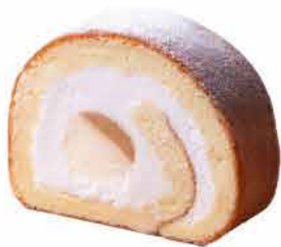
艾美生乳捲 Le Méridien Cake Roll NT$ 100