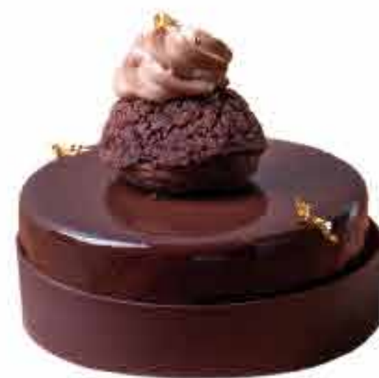
榛果巧克力泡芙塔 Hazelnut Choc. Profiterole Tower NT$ 160