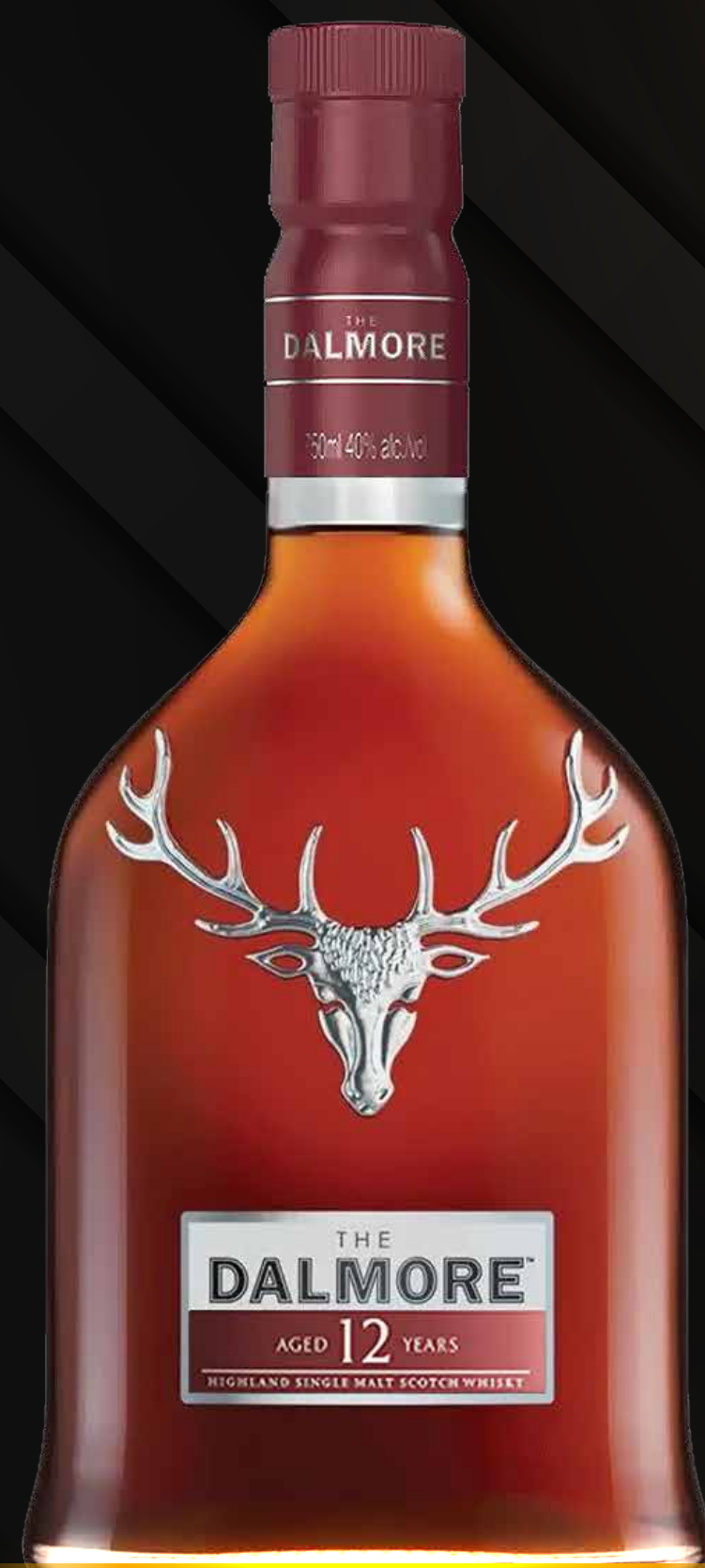
大摩 12 年 THE DALMORE 12Y